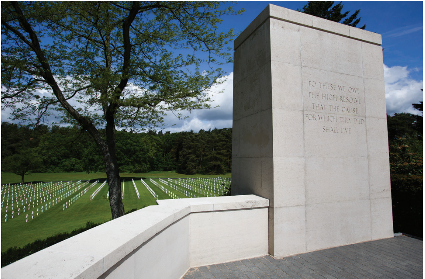
Lorraine American Cemetery Overlook

Overall, by maintaining close scrutiny of the Commission's obligation status, as well as monitoring and distributing the Foreign Currency Fluctuation Account balance, the Commission reduces its overall future financial risk to continued operations.