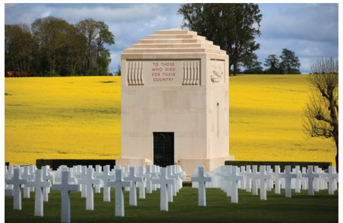
Somme American Cemetery Memorial