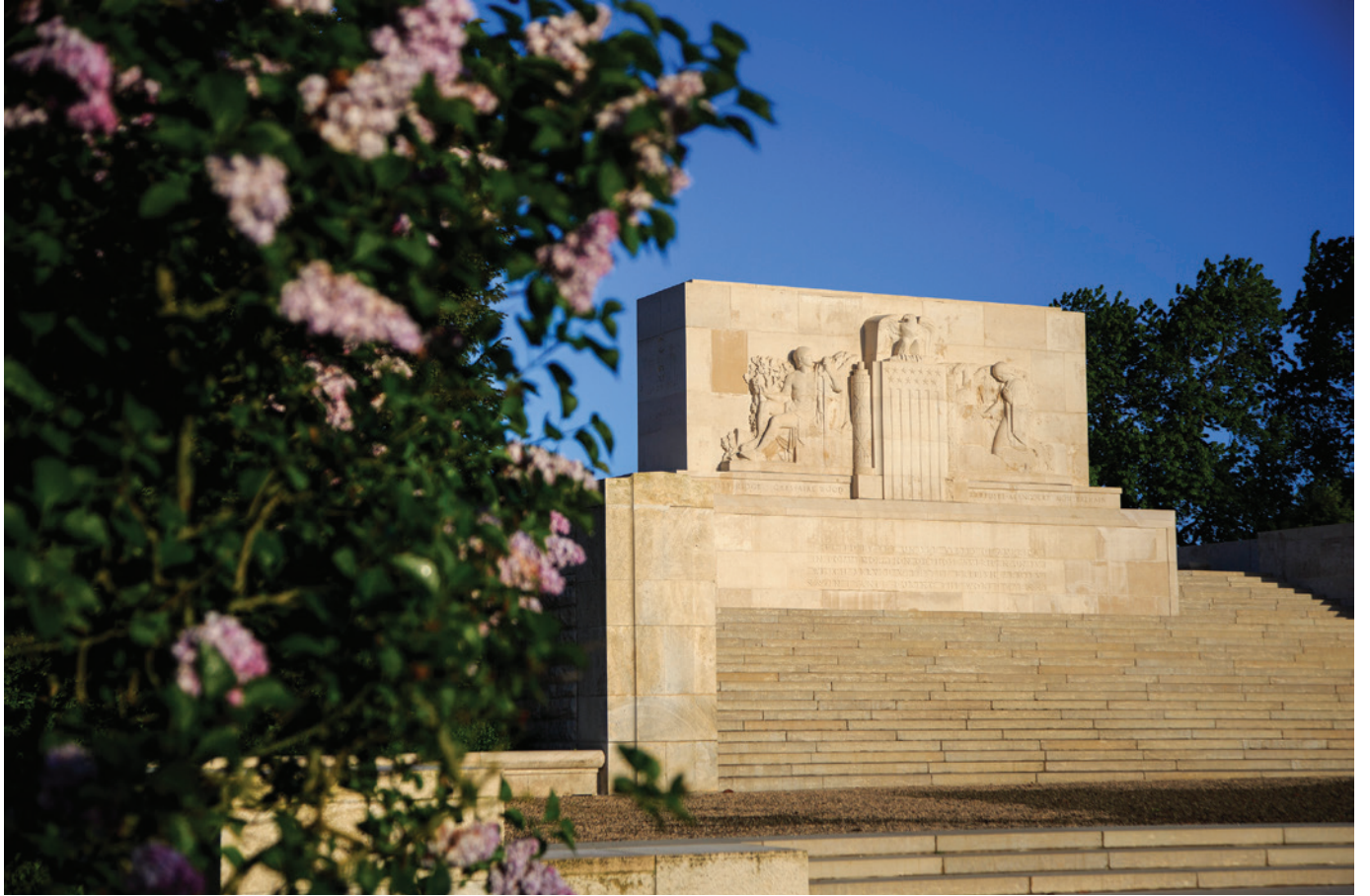
Bellicourt American Monument