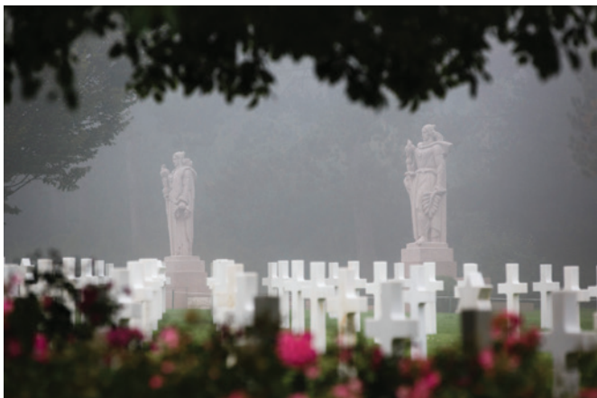
Normandy American Cemetery Statues