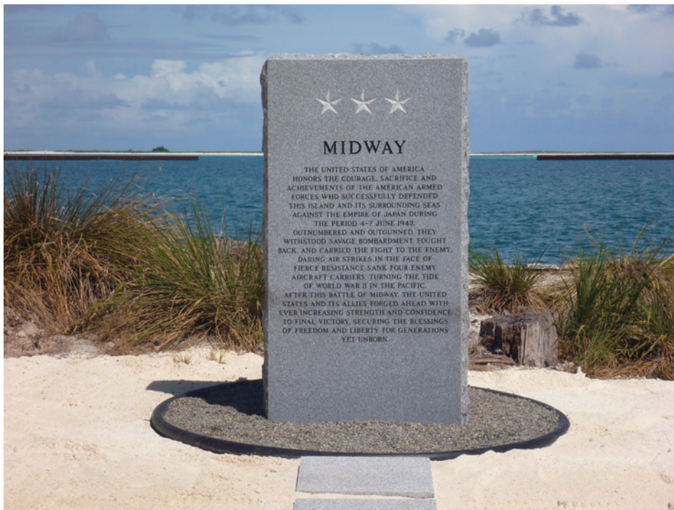
Midway Monument