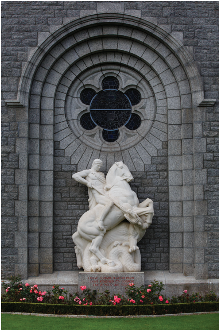
Brittany American Cemetery Memorial Statue