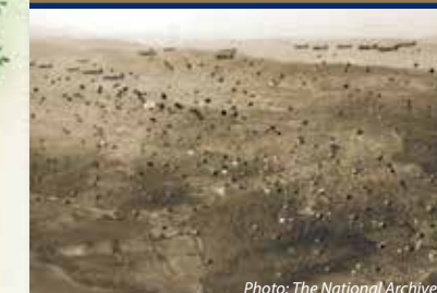
Paratroopers of 551st Parachute Infantry Battalion drop near Le Muy, France, Aug. 15, 1944.

The graves area is divided into four plots surrounding the oval center pool. Olive trees among the 860 headstones lend an unforgettable peacefulness to the scene.