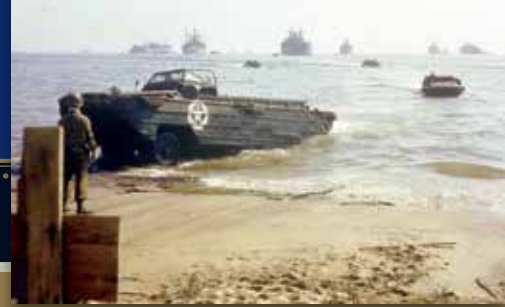
Amphibious trucks (DUKWs) bring supplies to a landing beach in Southern France, August 1944.

KEY: † Military Cemetery 🪂 Parachute Drop