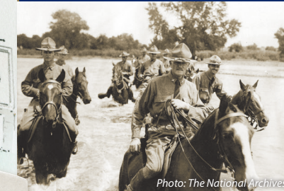
Brig.Gen. John J. Pershing and staff ford a stream near El Valle, August 1916.

The visitor room is on the immediate right from the entrance. Here you can meet our staff, get your questions answered, and sign the guest register.