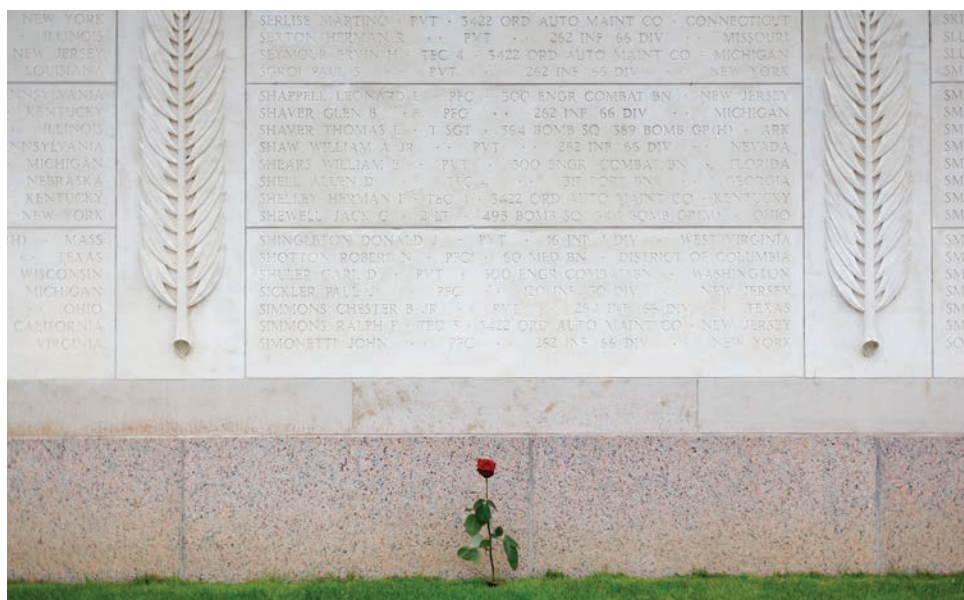
Detail of the Walls of the Missing.

Facing west at the memorial, the reflecting pool is in the foreground; beyond are two flagpoles where the American flag flies daily, and the burial area with a circular chapel.