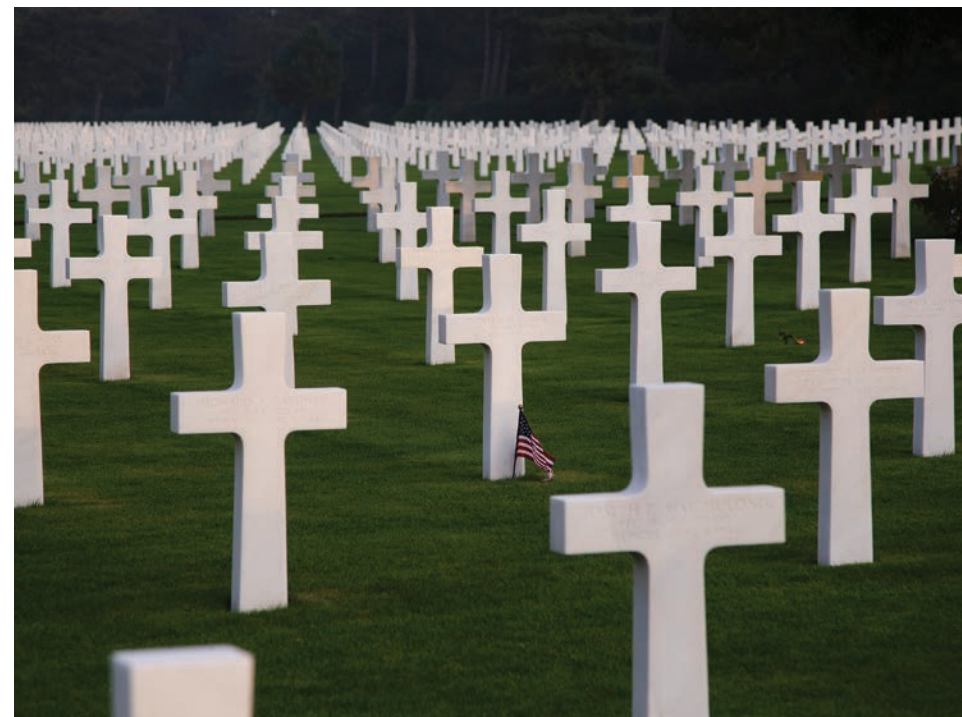
Headstones in Normandy American Cemetery.

Operation Cobra began on July 25. Preceded by an intense air bombardment, U.S. forces pressed south, breaking through German defenses and liberating the town of Coutances. They pushed on through Avranches, repelled a German counterattack at Mortain, and sped west into Brittany and east into the German rear. In Brittany, the advancing U.S. troops quickly drove scattered German units into fortified coastal enclaves. Moving east, the Americans, British, and Canadians, reinforced by Free French and Polish forces, encircled and destroyed German forces in the Falaise Pocket. They advanced on to Paris and, supported by an Allied invasion advancing up from the Mediterranean Coast, liberated the rest of France. Germany would be next.