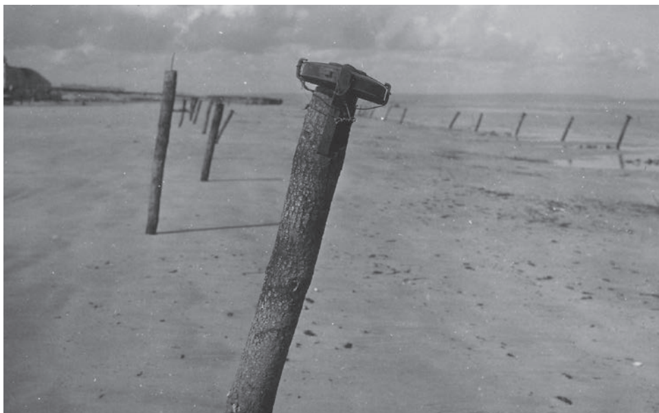
The German Army installed formidable defenses on the beaches of Normandy, including teller mines attached to stakes.

Eisenhower and his staff knew that the success of the amphibious landings depended on quickly establishing a secure beachhead. The first hours of the invasion would be crucial, a race between the Allies and the Germans to rapidly build up forces. Early on, the amphibious landing troops would be extremely vulnerable to counterattacks by German tanks and artillery. To mitigate these counterattacks, Operation Overlord included an airborne component; paratroopers would seize key objectives, such as bridges and road crossings, on the eastern and western flanks of the landing areas. They would also cover the movement of amphibious forces off the beaches, disrupt enemy defenses, and in some cases neutralize German coastal batteries. After securing the initial landing zones, the Allies intended to build up a well-supplied force capable of breaking out from the beachhead.