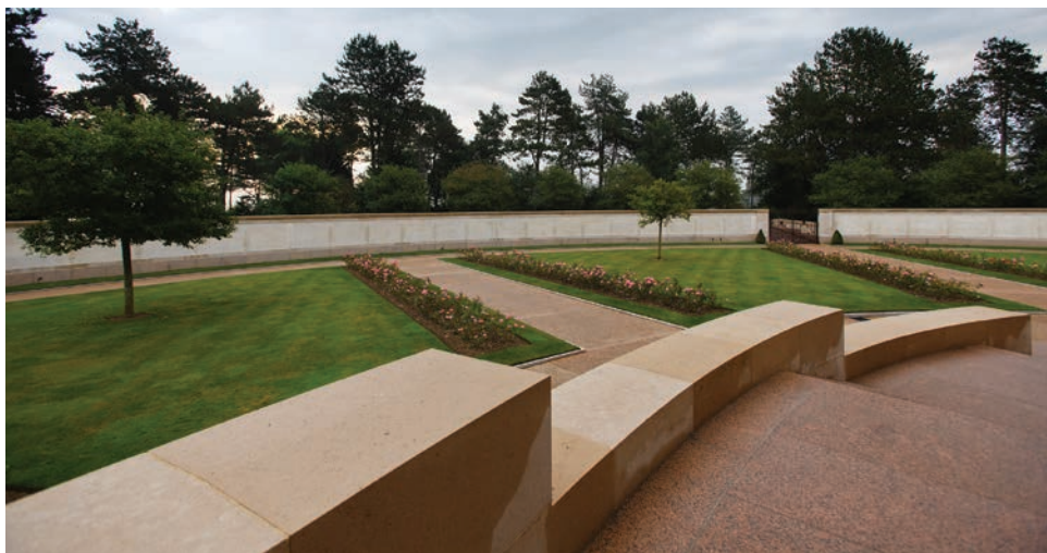
View of the Garden of the Missing.

The second version of the urn is inscribed with a figurative representation of God in Genesis, Chapter 1: “The spirit of the lord moved on the face of the waters.” On the water below, a spray of laurel recalls to memory those who lost their lives at sea; a rainbow emanates from each hand of the figure symbolizing hope and peace. The opposite side of the urn shows an angel pushing away a stone, symbolic of the resurrection.