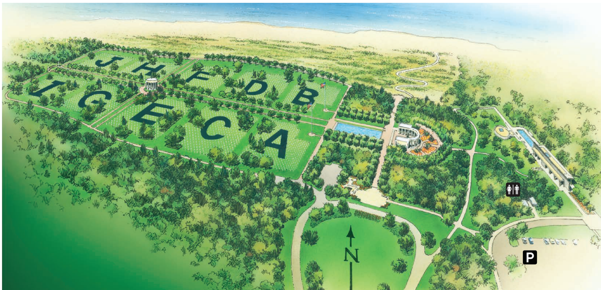
Illustrated map of the cemetery with the burial sections labeled.

Normandy American Cemetery was formed through the consolidation of ten temporary cemeteries in the region established during Operation Overlord and the campaign inland. The cross-shaped cemetery includes ten grave sections, five on each side of the main (east-west) mall. Within these sections there are 307 unknown burials, three Medal of Honor recipients, and four women. Forty-five sets of brothers are commemorated or buried in the cemetery, including 33 who are buried side-by-side. A father and son are also buried alongside each other. Every grave is marked with a white marble headstone: a Star of David for those of the Jewish faith, and a Latin cross for all others. The backs of the headstones are inscribed with the service numbers of the decedents. As in all ABMC cemeteries, the burials are not separated by rank; officers and enlisted men are interred side-by-side.