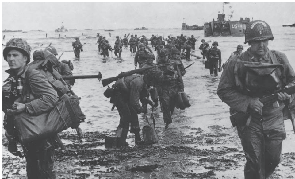
American troops move onto Omaha Beach.

By the end of D-Day, approximately 156,000 Allied soldiers had landed in Normandy, including 73,000 Americans. The Allies expanded the tenuous beachheads over the following days. Within a week, benefitting from continuous naval gunfire and air support, the five separate landing sectors were linked together. Temporary anchorages and artificial “mulberry” harbors were constructed off the coast, facilitating the unloading of troops and supplies.