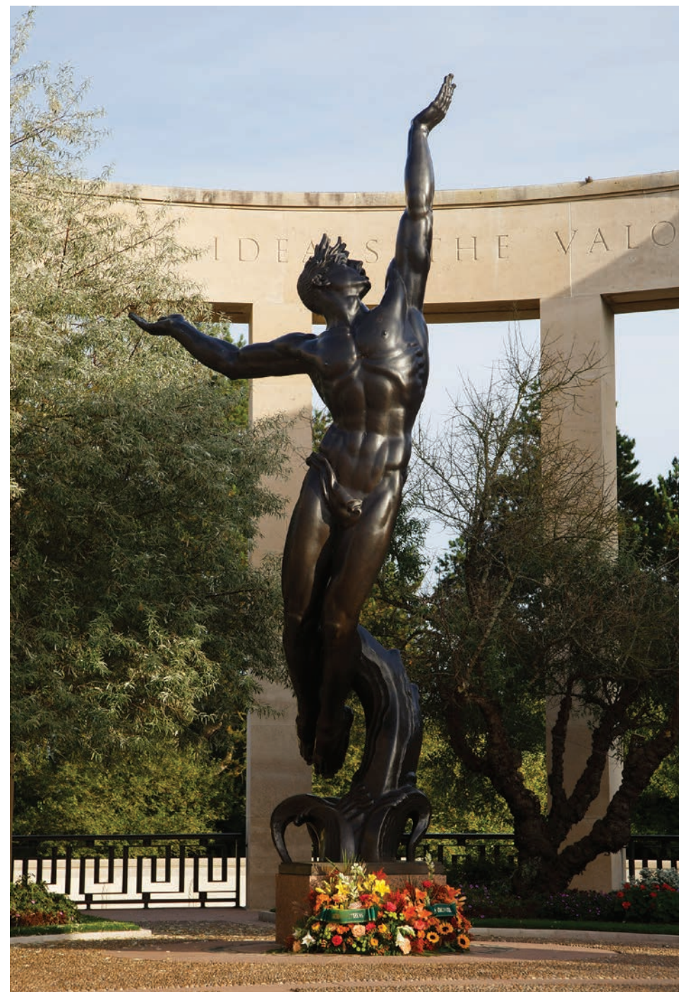
The memorial, “The Spirit of American Youth Rising from the Waves.”