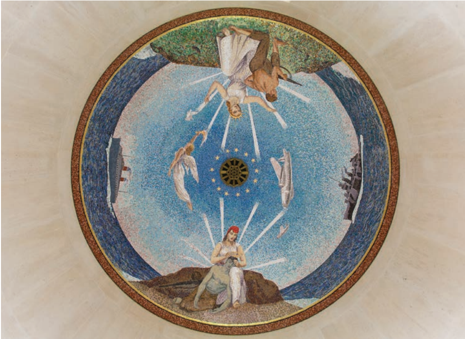
Chapel ceiling mosaic.

On the ceiling, a colorful mosaic depicts America blessing her sons as they depart by sea and air to fight for freedom, and a grateful France bestowing a laurel wreath upon American dead who gave their lives to liberate Europe's oppressed peoples. The return of peace is recalled by the angel, dove and the homeward bound ship.