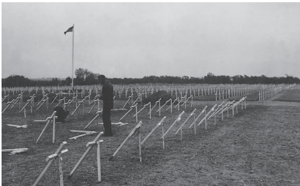
Wooden crosses in the temporary St. Laurent cemetery, 1947.