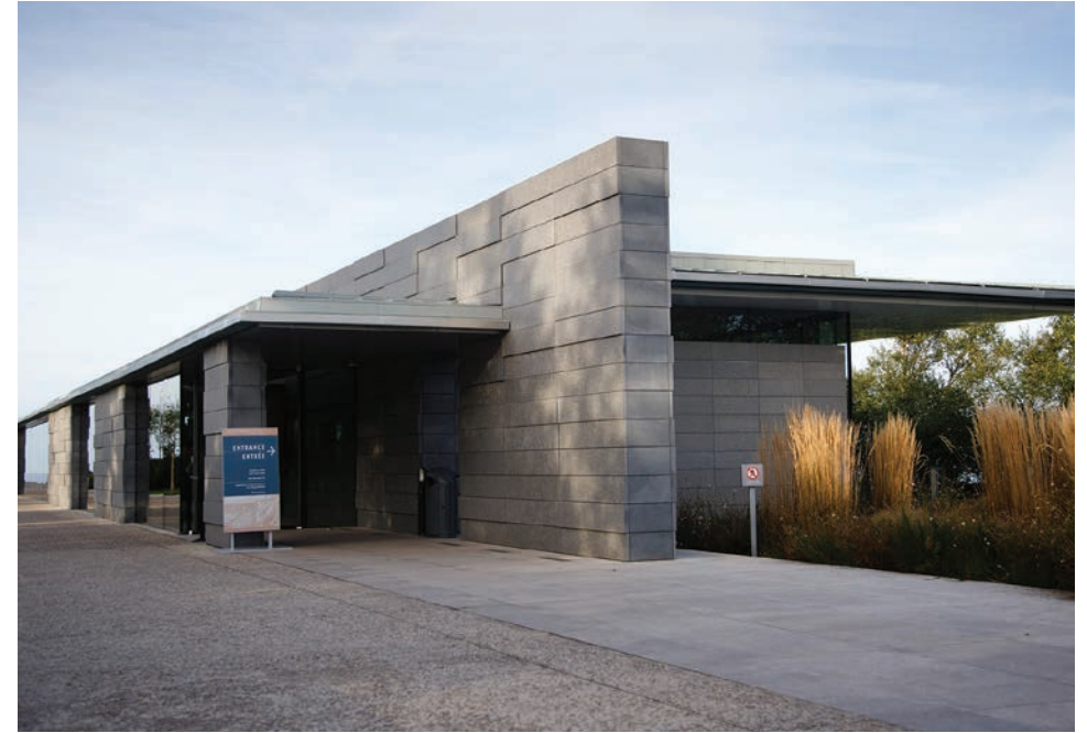
Exterior of the Visitor Center.

Embedded in the lawn directly opposite the entrance to the administration building is a sealed time capsule containing news reports of the Normandy landings. The capsule is covered by a pink granite slab and is dedicated to Eisenhower. It will be opened on June 6, 2044, on the hundredth anniversary of the Normandy landings.