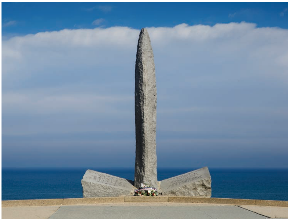
Pointe du Hoc Monument.