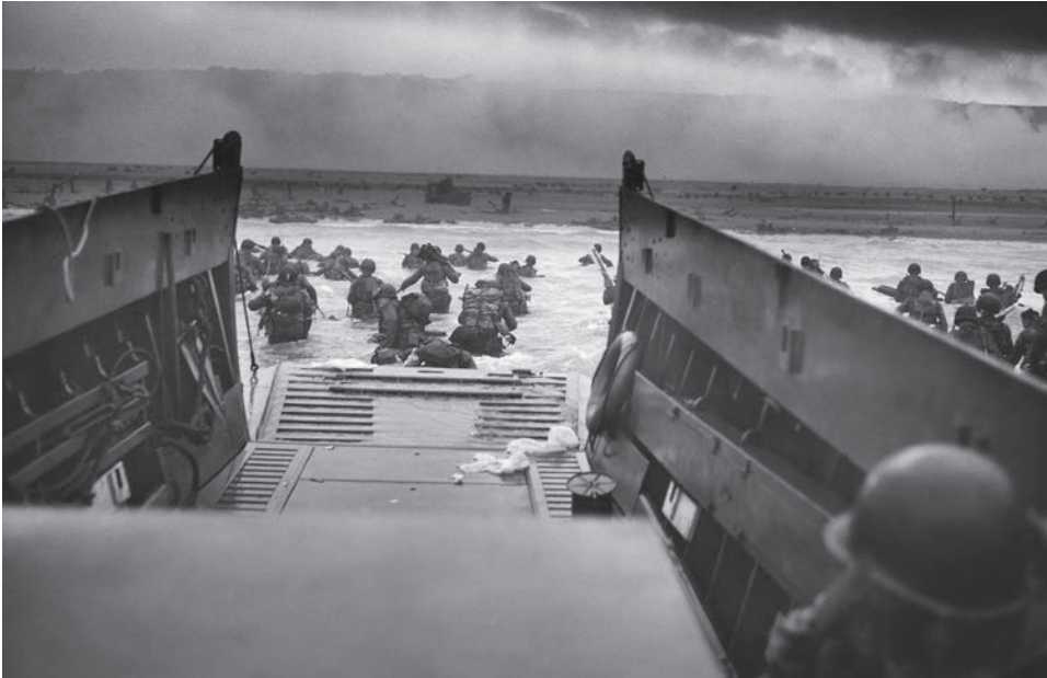
Soldiers from the 1st Infantry Division exiting a Coast Guard-manned landing craft onto Omaha Beach on D-Day.

Deception was crucial to the success of Operation Overlord. The Allies convinced German intelligence that the landings would occur to the north at Calais, along the narrowest part of the English Channel. Extensive but bogus Allied radio traffic reinforced the priority given to the false landing site by German intelligence analysts. Eisenhower's staff created a fictitious 1 st U.S. Army Group under Gen. George Patton, featuring fake tanks and trucks and apparently headquartered in Dover—just across the channel from Calais.