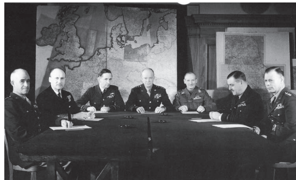
The seven Allied commanders responsible for planning Operation Overlord. From left to right: U.S. General Omar Bradley, U.K. Fleet Admiral Sir Bertram Ramsay, U.K. Air Chief Marshal Sir Arthur Tedder, Supreme Commander U.S. General Dwight Eisenhower, U.K. General Sir Bernard Montgomery, U.K. Air Chief Marshal Sir Trafford Leigh-Mallory, and U.S. General Walter Bedell Smith.

The Dieppe raid turned into a disaster. Suffering a lack of naval and aerial support, the invasion force was trapped on the beach under German artillery fire. Counterattacks by German units inflicted heavy losses. After less than ten hours the Allied forces withdrew back