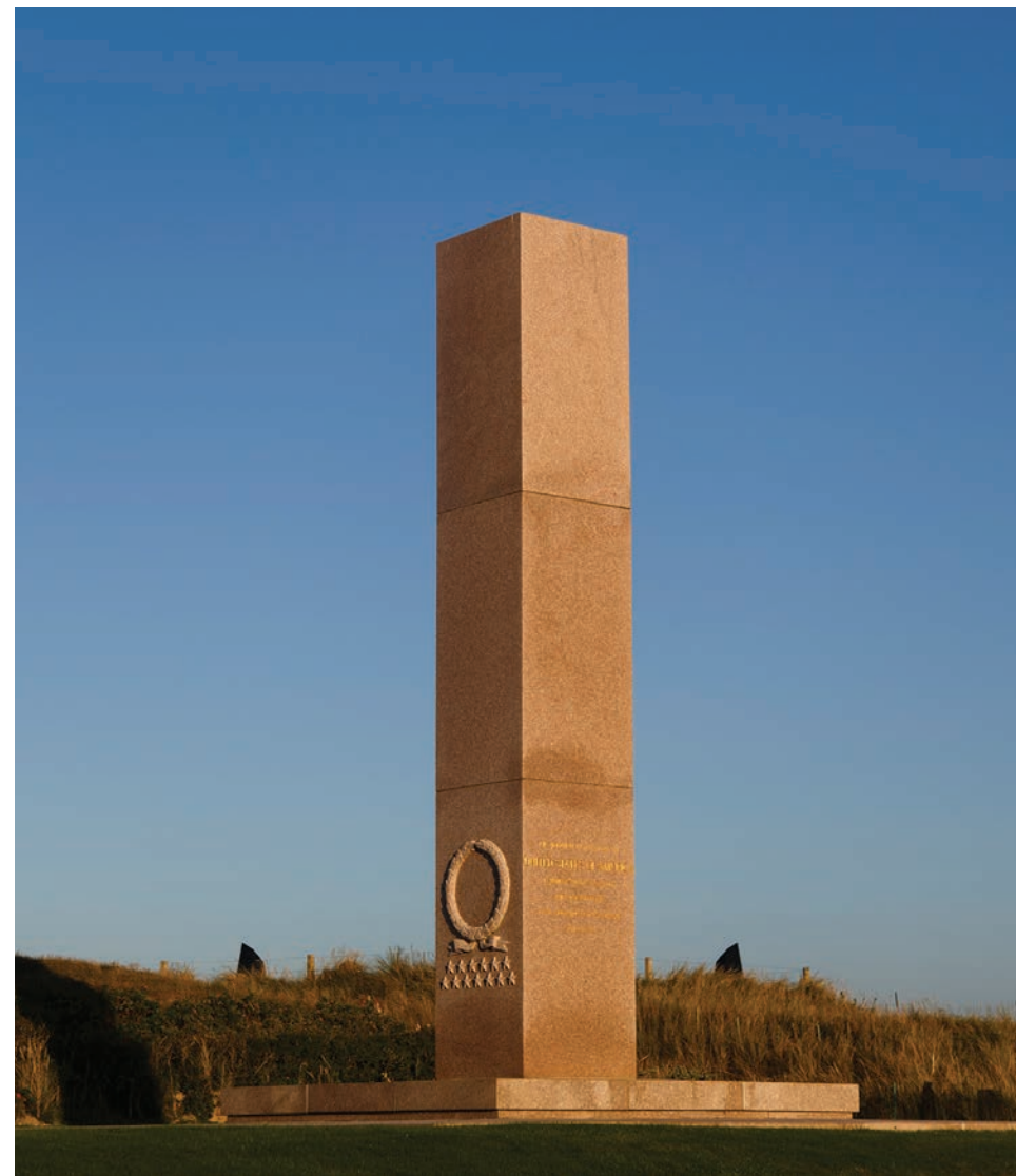
Utah Beach Monument.

The visitor center at the Pointe du Hoc Monument is open daily from 9 a.m. to 6 p.m. from April 15 to September 15, and from 9 a.m. to 5 p.m. the rest of the year. There is no charge for admission.