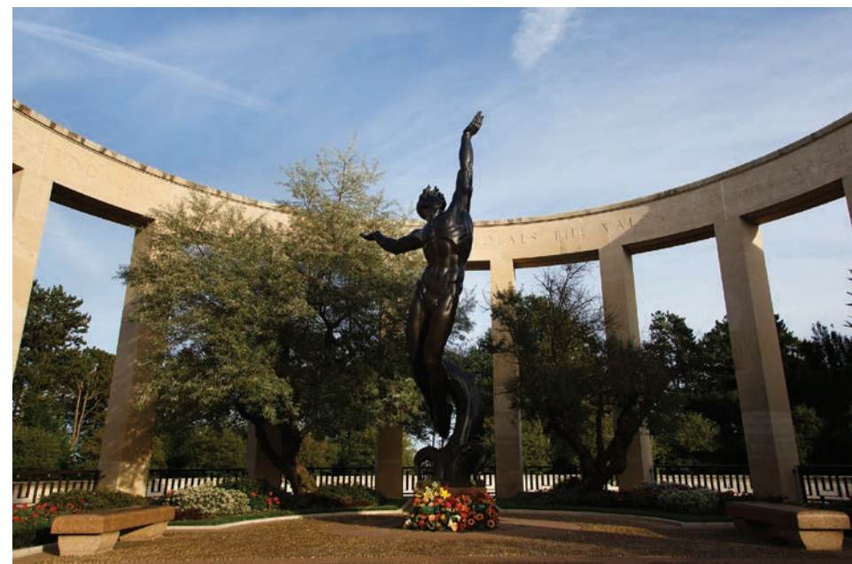
The memorial, with colonnade in the background.

YOU ARE ABOUT TO EMBARK UPON THE GREAT CRUSADE TOWARD WHICH WE HAVE STRIVEN THESE MANY MONTHS. THE EYES OF THE WORLD ARE UPON YOU ... I HAVE FULL CONFIDENCE IN YOUR COURAGE, DEVOTION TO DUTY AND SKILL IN BATTLE.