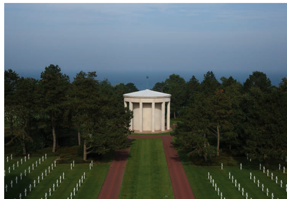
Chapel, with the English Channel in the background.

South of the memorial, the path leading to the administration building—the former visitor center—is the Allée Coty, named after René Coty, President of France from 1954-1959.