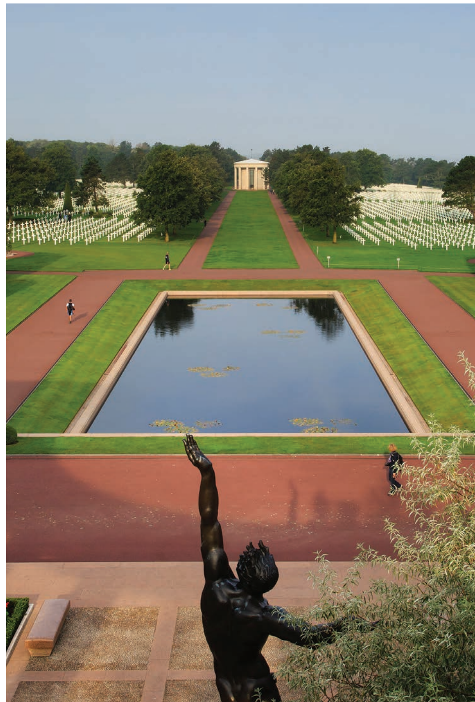
View of the reflecting pool and cemetery from the memorial.